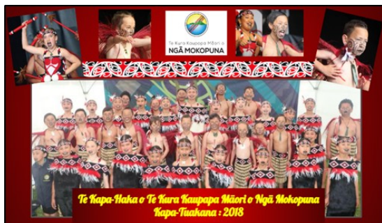
E tū te haka a Tānerore, Poia te pai a Hine Rēhia Ko ngā Mna whakairo a Toi he kurahuna nā Te Whare Tapere