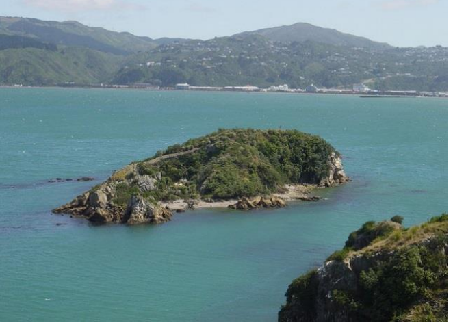
Te moutere o Mokopuna – mai te moutere o Matiu

Tāpiringa 4 – Whakataunga Pūtea me Pūrongo Kaitātari Pūtea 2017<sup>15</sup>